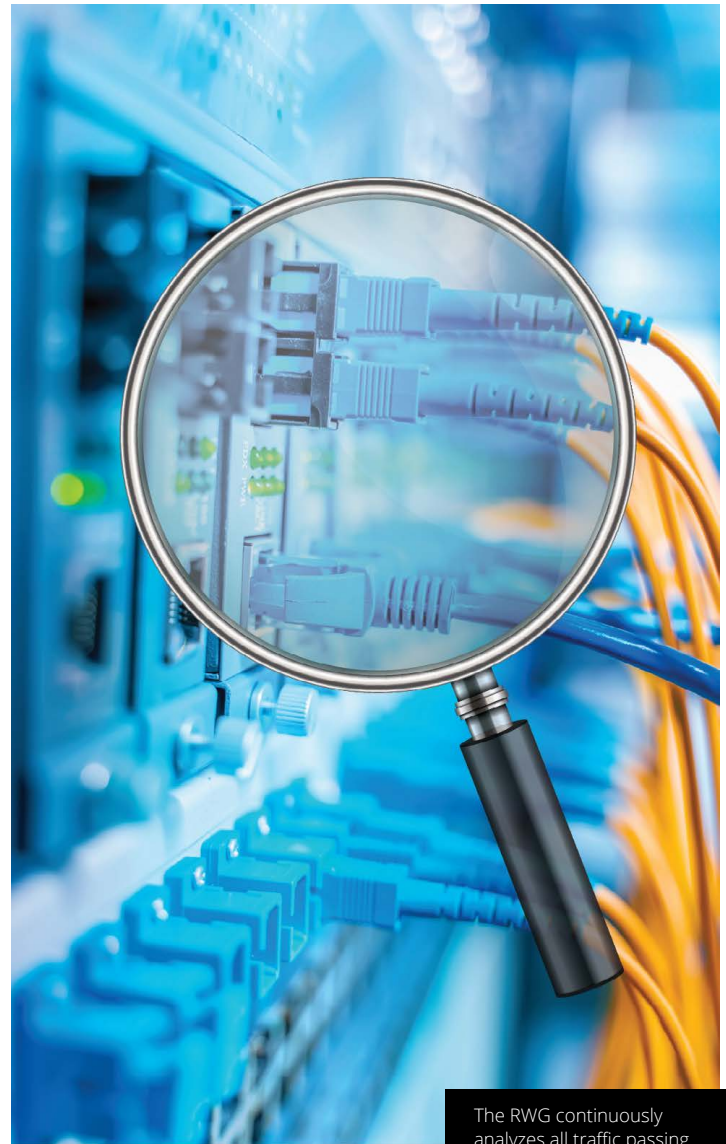
The RWG continuously analyzes all traffic passing through it.

In addition, RWG’s advanced features and capabilities make it a highly effective solution for securing your network infrastructure. Its robust firewall capabilities and VPN concentrator, which supports both IPsec and OpenVPN protocols, ensure that data is encrypted and protected during transmission. RWG also provides powerful micro-segmentation capabilities, allowing for ultra-high scale microsegmentation and deeply integrating with the RADIUS NAS built into RUCKUS SmartZone and ICX switches to create a deeply micro-segmented network architecture in support of a ZTNA.