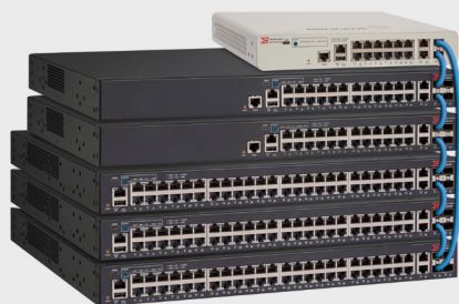
Figure 1. Stacking on standard Ethernet ports A stack of ICX 7150 showcasing the use of standard SFP+ 10Gbps dual-purpose ports and standard SFP+ short copper cables. The same ports can be used as 10GbE uplinks when not used for stacking.